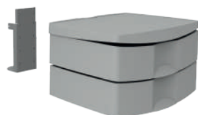
Ref. No. 30097