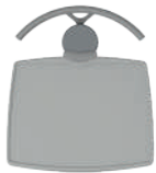
Ref. No. 19312