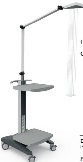
Ref. No. 30361