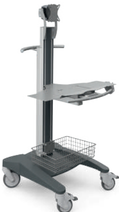
Ref. No. 30201