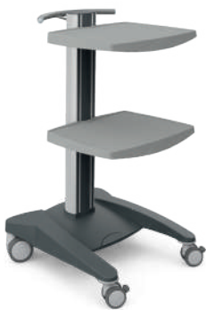
Ref. No. 30031