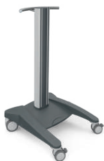
Ref. No. 19651