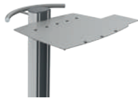
Ref. No. 19320