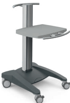
Ref. No. 19781