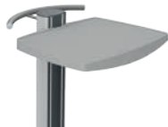
Ref. No. 19033