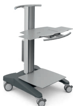
Ref. No. 30211