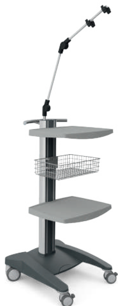
Ref. No. 19621