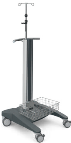
Ref. No. 30191