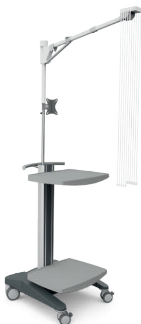
Ref. No. 30181