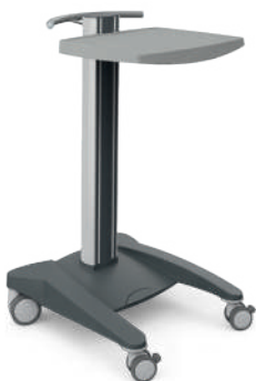
Ref. No. 30001