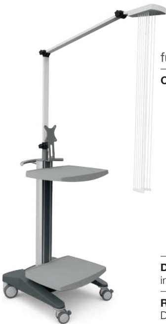
Ref. No. 30171