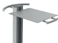
Ref. No. 19539