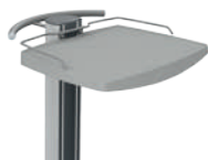
Ref. No. 19017