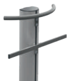
Ref. No. 30016