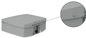
Ref. No. 19376