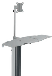
Ref. No. 19222