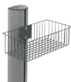
Ref. No. 19146