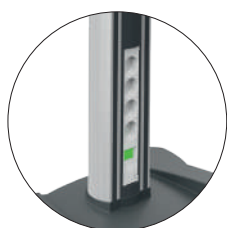
Ref. No. 21696

You will find a larger selection of products in the accessories chapter.