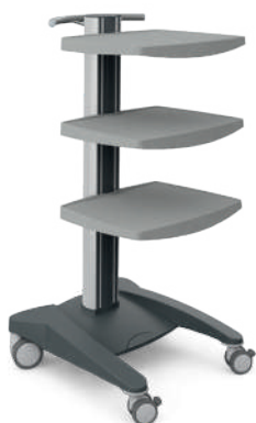
Ref. No. 30041