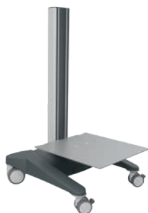
Ref. No. 19951