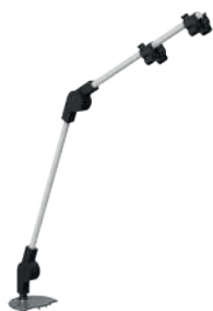
Ref. No. 19034