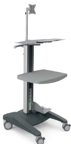
Ref. No. 19581