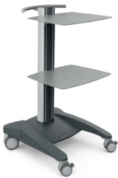
Ref. No. 30231