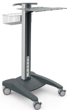
Ref. No. 30051