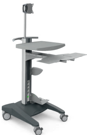
Ref. No. 19751