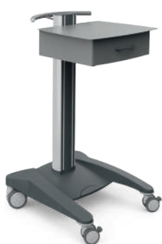
Ref. No. 30221