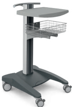
Ref. No. 30021