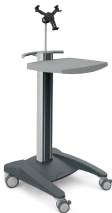
Ref. No. 30341