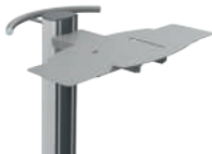
Ref. No. 19220