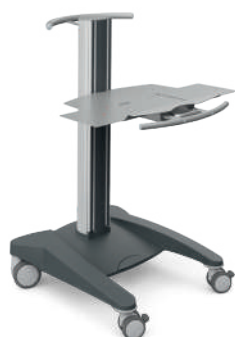
Ref. No. 30351