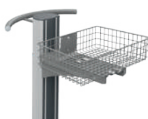
Ref. No. 19268