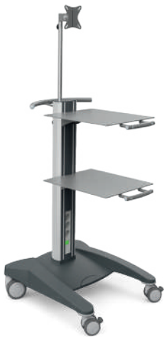
Ref. No. 30311