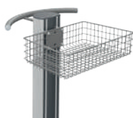
Ref. No. 19135