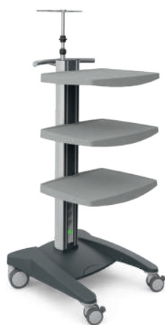
Ref. No. 30081