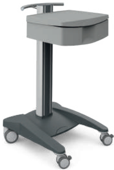
Ref. No. 30011