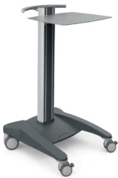
Ref. No. 30241