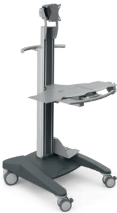
Ref. No. 19791