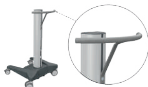
Ref. No. 19865