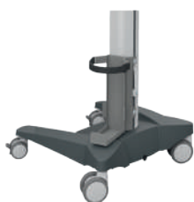
Ref. No. 19403