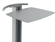
Ref. No. 19330